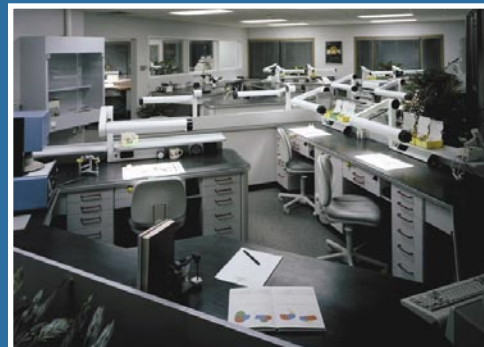
The state-of-the-art ceramics department was fully completed in 1993, two years after the lab was built.