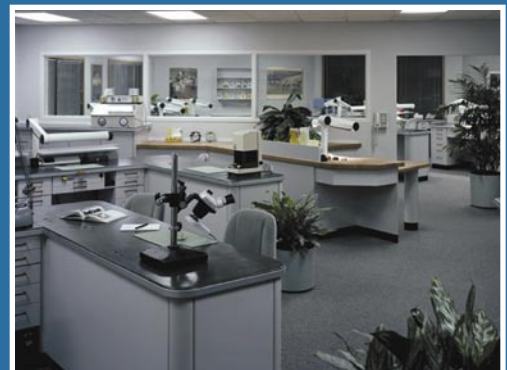
The contour and finishing department was designed for technician comfort and allows an efficient workflow.